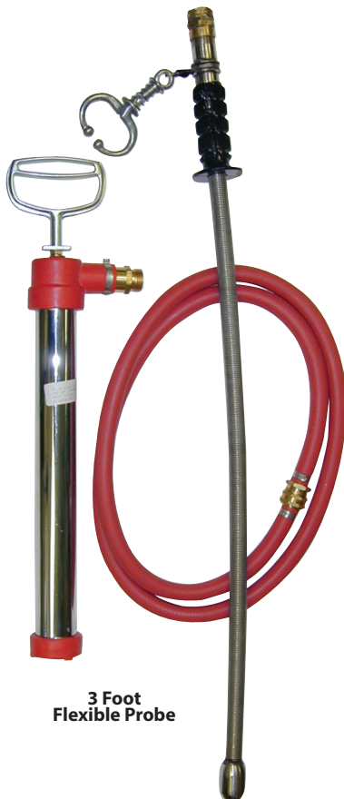
3 Foot Flexible Probe